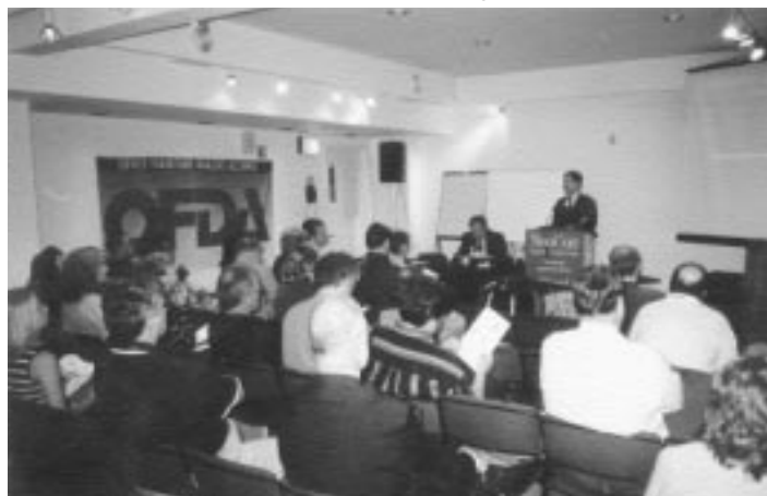
First Event BIFMA Members Took Their "Ergonomics Guideline Explained" Campaign

Industry specialists and corporate ergonomists who volunteered their time to BIFMA to write the guideline will serve as panelists and presenters at future forums. A fee of $35 will be charged at each forum and partic-